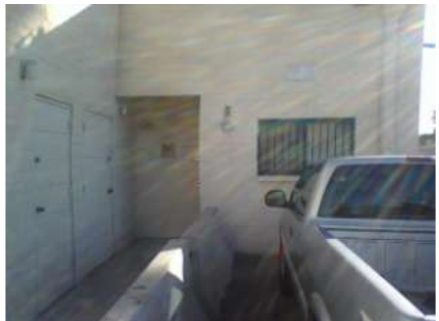
parking via E. Earl Drive (north of building). First alley, left off Earl to fenced lot. Rear door with door bell (not shown)