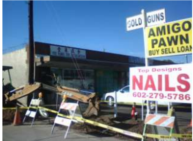
Amigo Pawn sign at front of YEE-FUNG-TOY, it is on the south side of the building. Access to rear